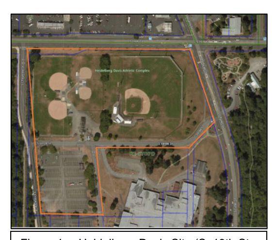
Figure 1. Heidelberg-Davis Site (S. 19th St. & S. Tyler St.)

Proposed by the Planning and Development Services Department and the Public Works Department, this application compiles 35 minor and non-policy amendments to the One Tacoma Comprehensive Plan and the Land Use Regulatory Code, intended to update information, correct errors, address inconsistencies, improve clarity, and enhance applicability of the Plan and the Code.